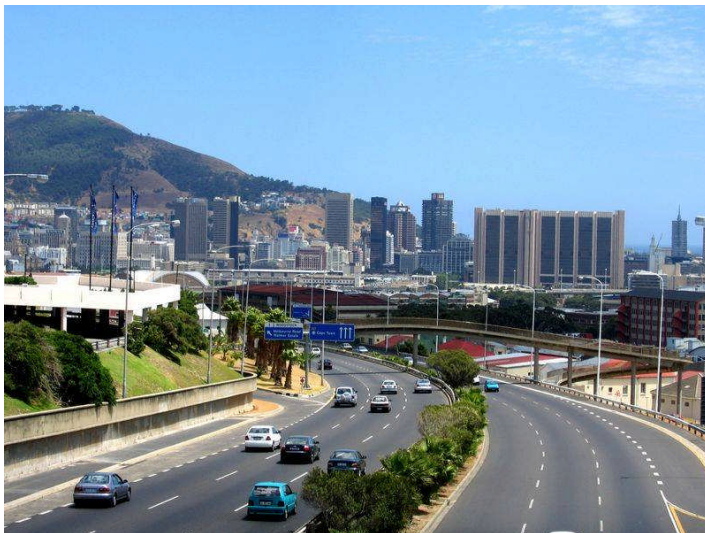
Drive towards Cape Town city centre and Waterfront

Day 16 In the afternoon departure from Cape Town (or extension – recommended)